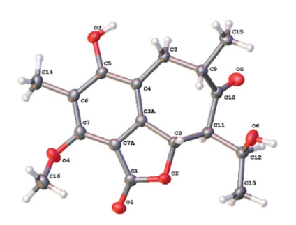
Fig. 4 The ORTEP drawing of 1.

[absolute structure parameter: 0.01(15)] to be (3S,9S,11S,12S) (Fig. 4).