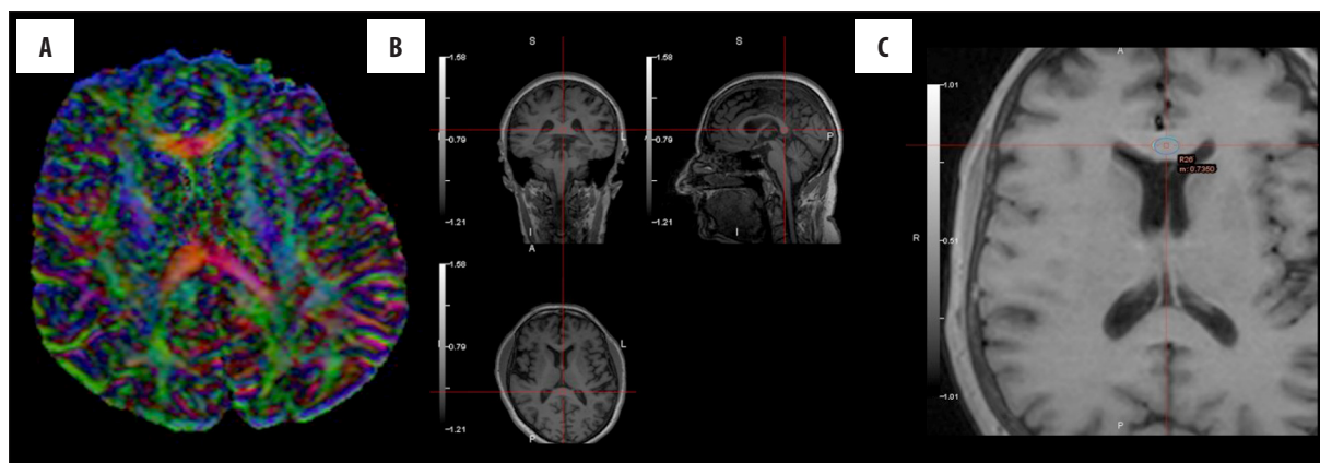
Figure 1. (A) A map of fractional anisotropy; (B, C) A way of putting ROI within the corpus callosum.