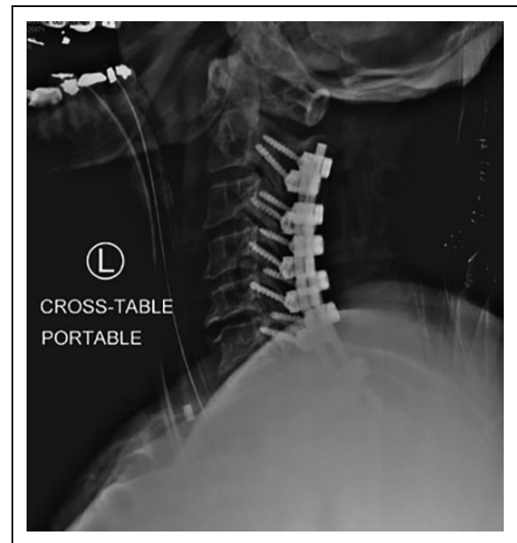
Figure 3. Postoperative radiograph following posterior C2-T1 decompression and fusion for cervical epidural abscess.

Management strategies for cervical SEA include systemic antibiotic administration, CT-guided aspiration of abscess plus antibiotics, and surgical abscess evacuation plus antibiotic