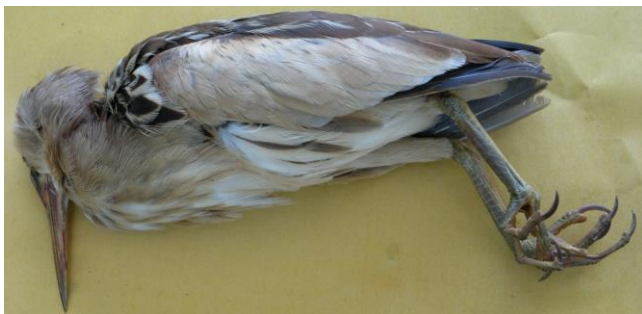
Fig. 1. Carcass of the little bittern referred by local authorities of Iran Department of Environment for necropsy.

Routine necropsy was performed on the dead bird. White chalky deposits were observed on serous surfaces of the heart and thoracic air sacs (Fig. 2). No obvious gross