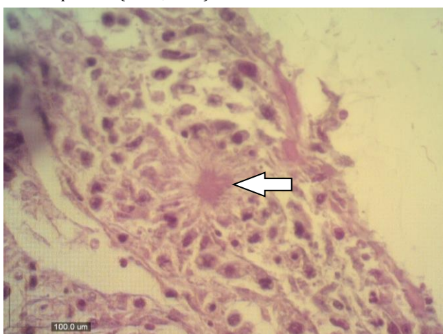
Fig. 4. Pericarditis with urate tophi (arrow) in a little bittern with visceral urate deposition (H & E, 400×).

Masses of fat deposits in peritoneal cavity of the little bittern and relatively good musculature showed that the condition had led to its death during an acute course. In acute renal failure visceral urate deposition might occur alone. 11 Inflammatory reactions are not often detected as birds die rapidly. Hyperkalaemia can develop, and this, rather than the uric acid, might lead to cardiac arrest and the sudden death seen with visceral urate deposition. 7 Factors, such as dehydration and vitamin A deficiency are common causes of visceral urate deposition in domestic poultry, 5 but they could not cause visceral urate deposition in domestic poultry, 5 but they could not cause visceral urate deposition and acute death in this case, since little bitterns had free access to water sources and variety of feeds.