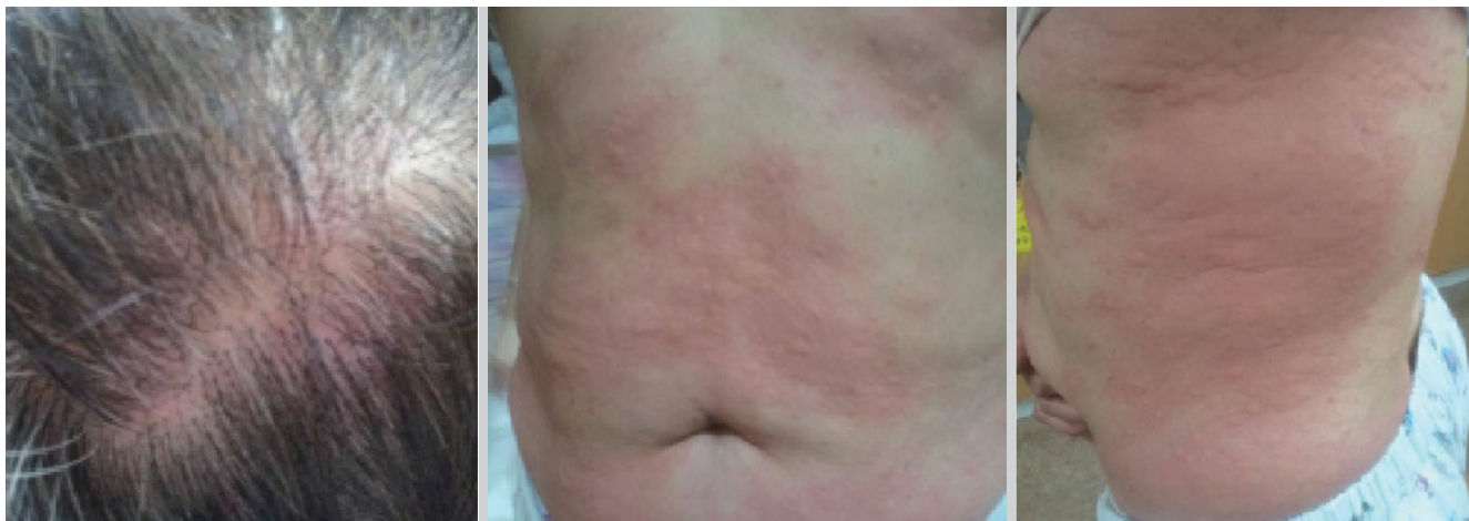
Fig. 1. Variable-sized hives involving the scalp and trunk.