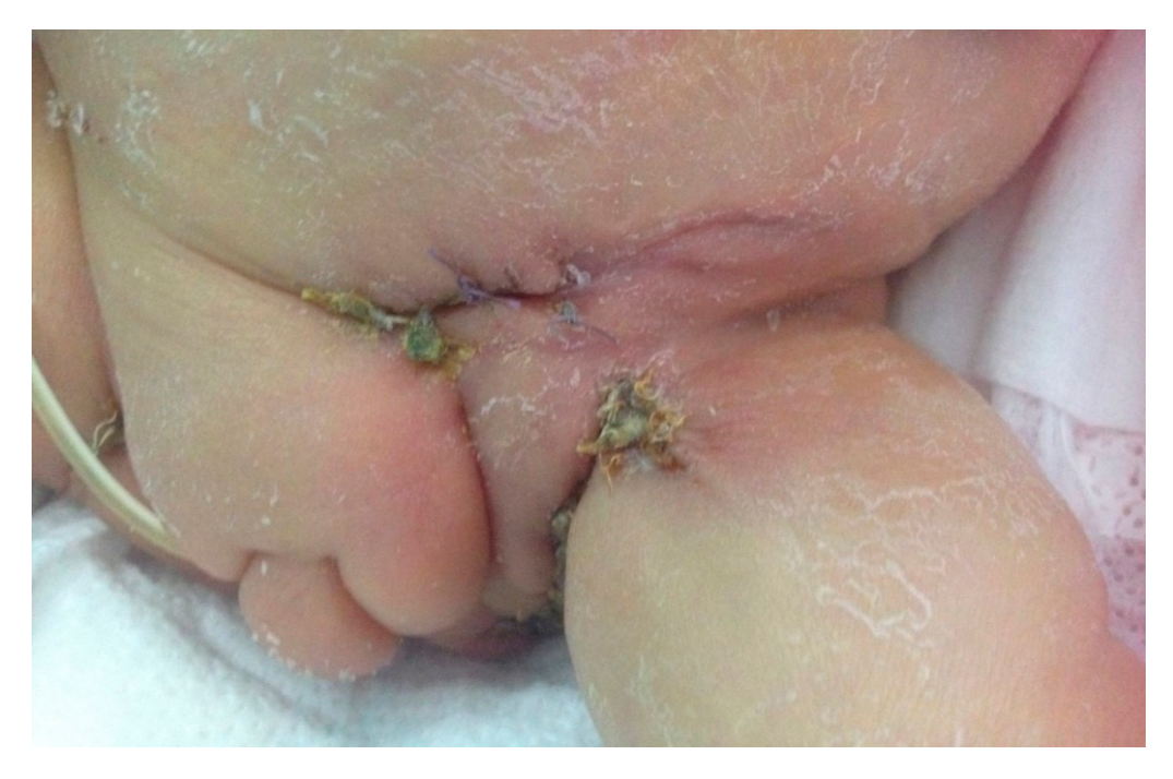
Figure 3. Gradual resolution of skin wounds after skin grafts.

Subsequently, cutaneous lesions were treated with two skin grafts (Figure 3). In order to allow the rapprochement with her parents, the child was transferred back to the hospital of origin, where she died after 2 months due to respiratory failure related to her severe bronchopulmonary dysplasia.