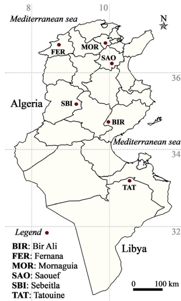
FIGURE 1 Map of Tunisia indicating the sheep farms' locations (red dots)

belonging to 15 small to middle-sized (10 to 50 ewes par herd) and extensively-managed sheep farms in six regions across Tunisia and meant to represent different natural environments along the main sheep production areas in the country. In each herd, all female sheep aged more than 1-year old, were selected with corresponded to a total number of 338 animals (Table 1). The sampling sites are Fernana, Mornaguia, Saouef, Bir Ali, Sebeitla and Tataouine (Table 1; Figure 1). Sheep graze all around the year on natural rangelands and cereal stubbles in summer particularly in the case of the north-located farms. Farmers supplement their sheep with concentrate especially in winter. Water is provided either from public or natural resources and is more available in Northern Tunisia (Ibidhi, Frijia, Jaouad, & Hichem, 2018). Sheep are reared in mixed flocks with goats and with cows in the case of five farms. Spring is the main mating season and most births are spread during autumn and early winter (September–February).