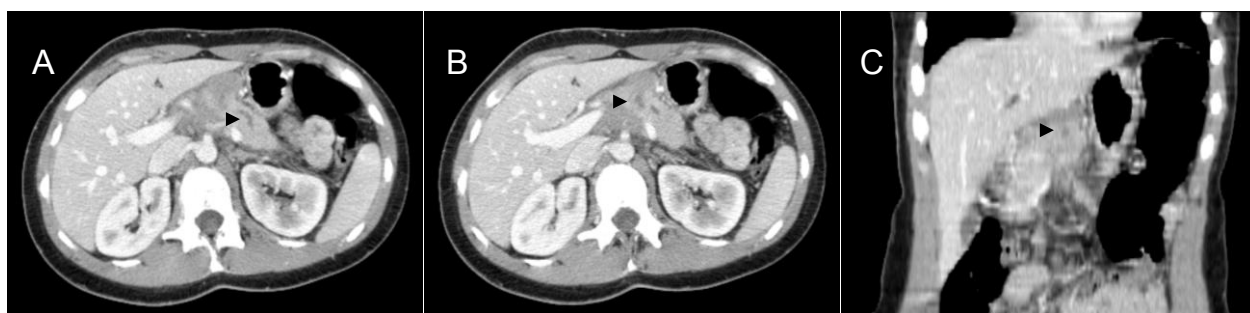
Figure 2 Abdominal computed tomodensitometry, with injection of contrast product, portal sequence. Axial (A) projection showing Wirsung dilatation (arrow head). Axial (B) and frontal (C) projections showing low density pancreatic mass (arrow heads), case n°2.

GS can occur in patients of all ages with a focus on male patients (male:female ratio 1.2:1) during the last decades of life (median age is 56 years, range: 1 month - 89 years) [7,16]. Even if the overall prognosis of AML is favorable, the association with GS makes worsens the prognosis because only 24% of patients with GS will be alive 2 years after the initial diagnosis, with an overall median survival of 7 to 20 months [3,17].