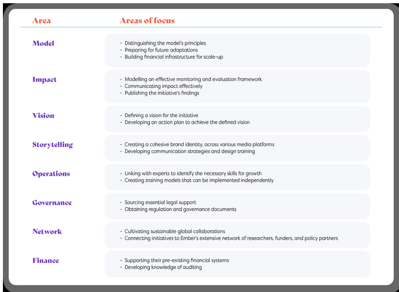
Figure 1 Areas of assessment of the Ember Health Check tool.

partnerships. The guiding research question was: what were the key achievements and shortcomings identified by initiatives from their partnerships with Ember?