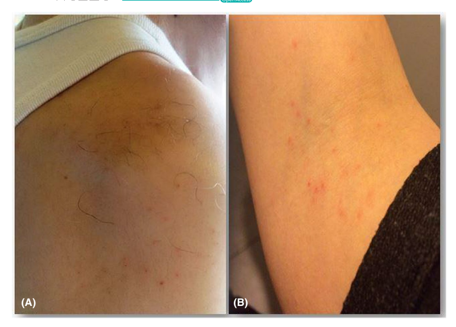
FIGURE 1 Multiple small reddish itchy papules on the right shoulder of the first patient reported as case 1 (A) and forearms of the second patient presented as case 2 (B)