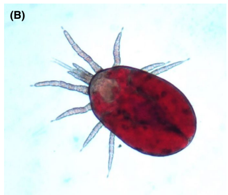
FIGURE 2 Microscopic illustration of Dermanyssus samples (A, collected from the first patient and B, from the second patient) processed in the present study

hours at the office. Numerous small, reddish, itchy papules were observed on his body (Figure 1A). No notion of pruritus was found before or during his presence outside his workplace. He brought some samples of an insect found in his office, which seem to be the biting bugs. Furthermore, to verify the working conditions of this patient, a visit was made by a member of Parasitology-Mycology department, where several insects of the same species were found. The exterior side of his office led to an open area, via a window, where the pigeons nested.