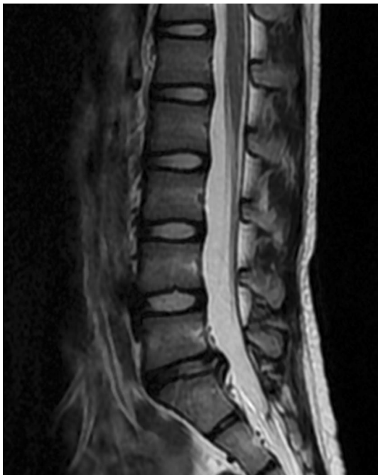
Fig. 1 MRI of the lumbar spine obtained at the 10-year-old girl's initial visit revealed Schmorl's node at L4 and S1, platyspondyly of the lumbar vertebrae, and a lumbar disc herniation at the L5/S1 level

A 13-year-old boy was hospitalized for sciatica in his left leg for over 3 months. He felt pain in the distribution of the sciatic nerve when sitting, standing, and walking. The physical examination revealed that Lasegue's sign was positive in the left leg, the level of muscle strength in the left ankle plantar flexors was grade 4, and the levels of lower limb sensation and bowel and bladder function were normal. MRI revealed platyspondyly of the lumbar vertebrae and a lumbar disc herniation at the L5/S1 level (Fig. 3). The boy was diagnosed with LDH at the L5/S1 level. The patient underwent 2 weeks of nonsurgical treatment of TCM, as case 1 did, and exhibited a favorable outcome: only mild pain was noticed in his left buttocks after walking for more than 15 min. He was asymptomatic at the 3-month follow-up and did not experience back pain or sciatica within the next 3 years; the MRI scan performed at 40 months