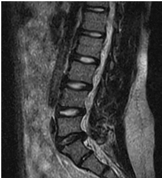
Fig. 3 MRI of the lumbar spine obtained at the 13-year-old boy's initial visit revealed platyspondyly of the lumbar vertebrae, and a lumbar disk herniation at the L5/S1 level