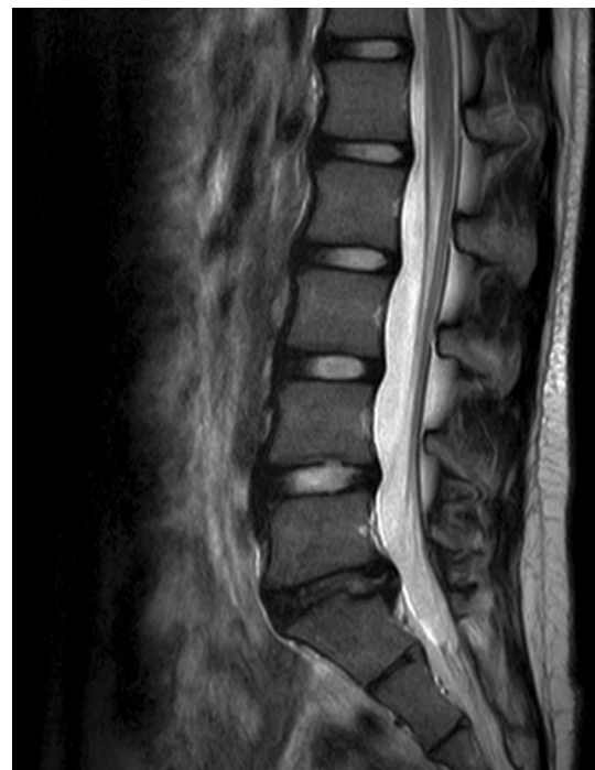
Fig. 2 MRI obtained at the girl's 30-month follow-up showed no significant changes in Schmorl's node at L4 and S1, platyspondyly of the lumbar vertebrae, and no significant resorption of the herniated L5/S1 lumbar disc