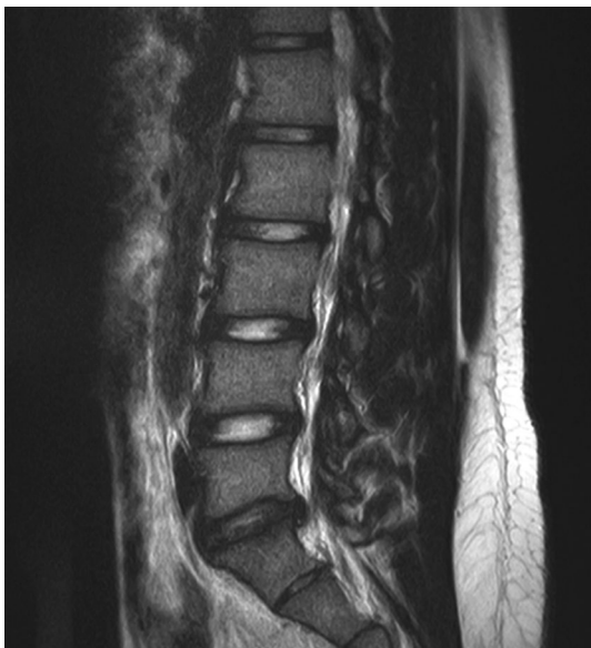
Fig. 4 MRI obtained at the boy's 40-month follow-up showed no significant changes of platyspondyly of the lumbar vertebrae and no significant resorption of the herniated L5/S1 lumbar disc

after the first MRI scan showed no significant changes of platyspondyly of the lumbar vertebrae and no significant resorption of the herniated disc (Fig. 4).