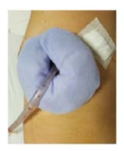
Group 1. Cold application with ice pack Group 2. Cold application with gel pad