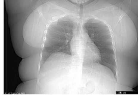
FIGURE 3: Chest X ray after treatment.

Pleural fluid growing MAC has been described in unrelated diseases the past, such as congestive heart failure and malignancy. These results are not regarded as clinically significant. However, if MAC is isolated from an enclosed space, it is generally regarded as the causative organism for the pathology observed [2]. Our patient did not present with features typical of the well described “Lady Windermere