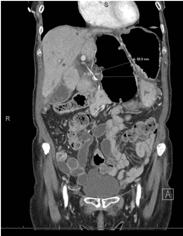
Figure 1: CT coronal view showing dilated loop of transverse colon medial to the lesser curvature of the stomach dilated to ~6 cm, which is involved in an internal hernia.