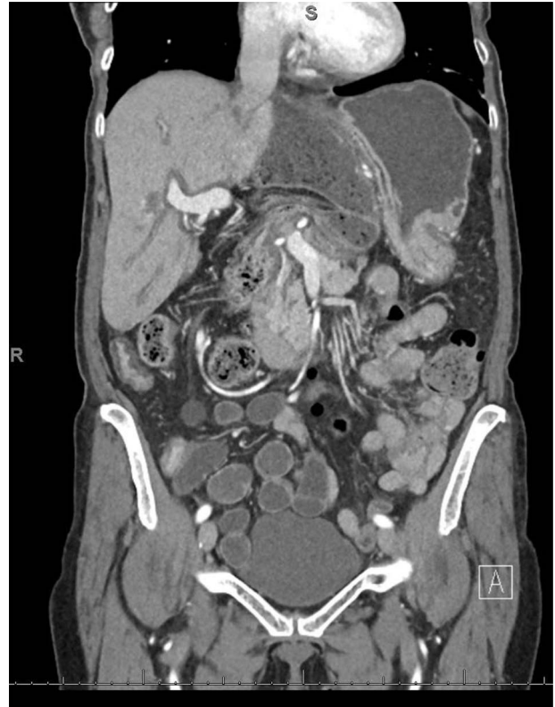
Figure 2: CT coronal view showing proximal and distal loops of transverse colon are seen in the region of the foramen of Winslow.