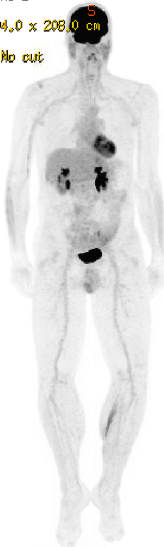
FIGURE 3: Five-year follow-up MIP scan