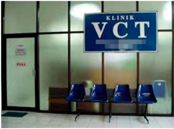
Figure 3. VCT Clinic Facilities in one of Public Hospital in Surakarta.

ART treatment, 486 reported died, 36 ceasing ART, 420 absent or failing to be followed up, and 249 referred to other hospital. This data is displayed in Figure 4.