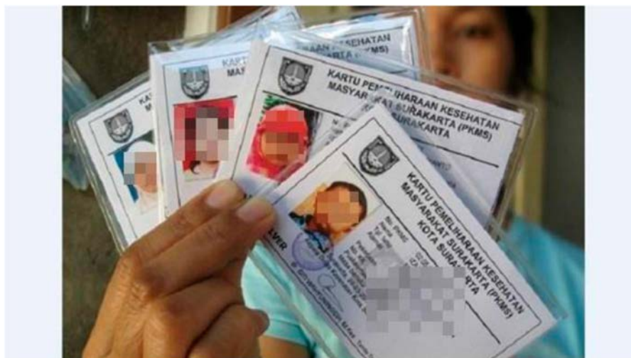
Figure 2. BKMKS card covering HIV/AIDS treatment fund particularly for poor people in Surakarta.

immunological or clinical failure. CD4 should be examined periodically to ascertain the treatment response. A2, C3, C4, C5, C6 and C7 argued that the largest laboratory cost is used for Viral Load, CD4, Rontgen, and liver function examination. However, B1, B2, B4 and B6 spend no fund for laboratory examination because of Surakarta City Government's policy supported by Global Fund-AIDS Tuberculosis and Malaria [GF-ATM] manifested into the NGO-caring about AIDS programme in Surakarta.