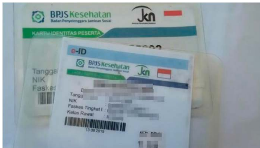
Figure 1. BPJS card that can cover treatment fee for HIV/AIDS and OI without complication.

Additionally, B1, B2, B3, and B5 always buy multivitamin to maintain their body stamina. They spend about IDR 70,000 – IDR 100,000 monthly. Meanwhile, B6 should buy formula milk monthly to fulfil her HIV-infected baby's nutrition, because she as PLWHA may not breastfeed her baby exclusively. A 900g-box of formula milk costs IDR 319,000.