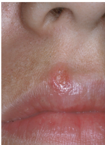
Fig. 1. A typical stage 2/3 recurrent Herpes labialis lesion.

The results of Trial 1 experimentation are illustrated in Table 2 and Fig. 2. Thirty-eight of the patients, by DIF, reacted with HSV-1 monoclonal antibodies; two of the patients reacted with HSV-1 and -2, a male and a female patient. A clinical photograph of a typical Stage 2/3 lesion is shown in Fig. 1. Although patients were accrued