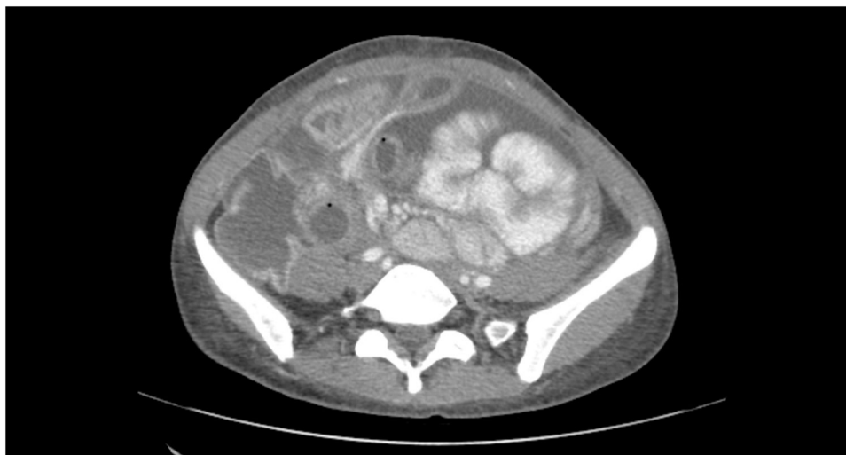
Fig. 2. CT from March 1, 2018 shows extensive ascites with small bowel clumped from mesenteric retraction by cancer.

upper quadrant as a result of her prior extensive cytoreductive surgery. Postoperatively, she required continuous nasogastric suctioning. On 03/26/2018, she underwent percutaneous placement of an esophagostomy tube by an experienced thoracic surgeon (PGK) [7]. A left-sided pneumothorax that occurred with the tube placement was treated by a chest tube. Throughout her hospitalization and on hospital discharge she was maintained on TPN. Intermittent pain was controlled with a Fentanyl transdermal patch (Janssen Pharmaceuticals, Inc., Titusville, NJ). This symptom management and nutritional support has continued for 4 months without incident while the patient searched for further treatment options. The patient died as a result of progressive disease on 05/02/2018.