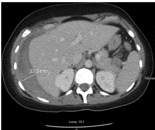
Fig. 4. Computerized tomography scan with intravenous contrast, postpartum day 8.

In order to classify injuries and help guide management, the American Association for the Surgery of Trauma (AAST) created a classification system that grades the extent of injury from grade I to grade VI (Table 2). As hepatic hematomas from HELLP syndrome are rare, critical care management can be guided using the AAST classification. In data published by the National Trauma Data Bank (NTDB), approximately 67% of hepatic injuries were between grade I and grade III [8]. Hemodynamically stable patients with low-grade injuries (I, II, III) were able to be successfully managed without surgical intervention [8]. For patients with grade IV and V injuries, non-surgical management was less successful, and patients with grade VI trauma (hepatic avulsion) were