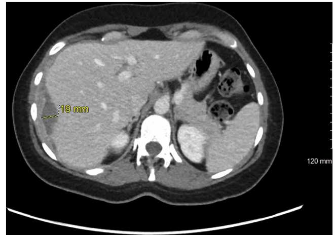
Fig. 5. Computerized tomography scan with intravenous contrast, 2 months postpartum.

universally unstable and required surgical intervention [8]. Our patient had a hematoma that was >10 cm intraparenchymal and therefore categorized as grade III. Similar to the published trauma literature, our patient's grade III hematoma responded to non-surgical management.