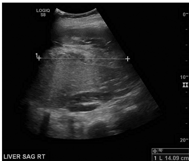
Fig. 1. Ultrasound scan of the right upper quadrant.

As with this case, early suspicion for SLH should lead to prompt evaluation and diagnosis. The choice of imaging studies should be based on availability and how quickly they can be performed. Therefore, portable ultrasound is a good screening tool as it is the quickest and can be