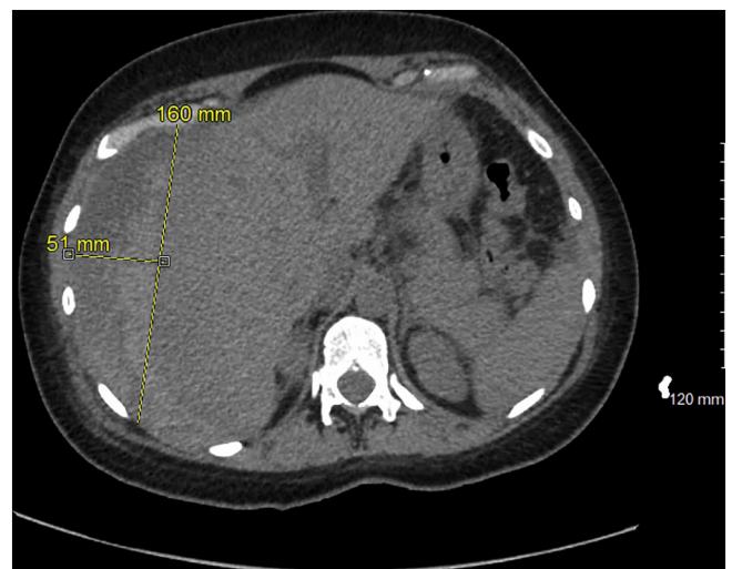
Fig. 2. Computerized tomography angiogram, postpartum day 0.