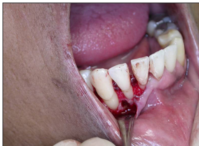
Figure 2. Photograph showing bone cavity after enucleation of the cystic lesion.

The pathogenesis of LPC may be related to the three etiopathological hypotheses: reduced enamel epithelium [9], remnants of dental lamina [11] and cellular remnants of Malassez [1]. The first hypothesis is that the cyst is lined by nonkeratinized epithelium reminiscent of the reduced enamel epithelium which is supported by PCNA immunohistochemical expression. The second theory is related to dental lamina remnants,