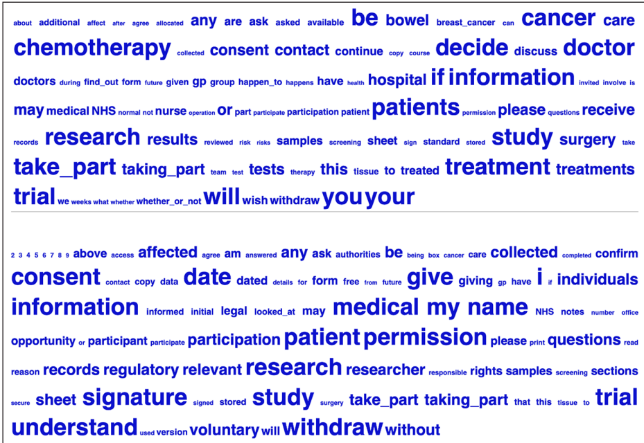
Figure 2. Keyword cloud from PIS corpus (above) and CF corpus (below).

uncertainty or condition in the PIS keyword cloud, ‘consent’, ‘permission’, ‘confirm’ and ‘understand’ in the CF keyword cloud imply affirmation.