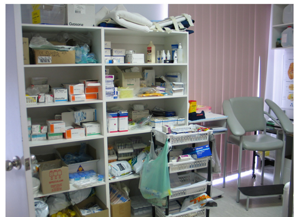
Figure 5 Clinical storage area.

The six primary operating roles of general practice nurses identified in this study have been described elsewhere [18], but include: patient care; organisation; problem solving; quality control; education and connectivity. Nurses move consistently through practice space as they cycle between these operating roles. The physical characteristics of the practice space influence these roles through the positioning of nurse spaces, their accessibility, and the