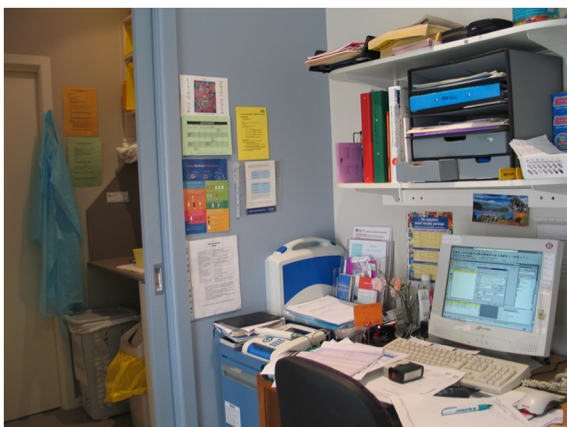
Figure 4 Nurse work station.

By contrast, the nurse desk in Figure 4 is not in a primarily clinical area, but in a shared administration area, adjacent to storage rooms. Here, there is much more ‘intrinsically passive’ material, with social objects found in the form of the jellybean jar and the pot plant. A common feature of all these workspaces is the presence of posters/handouts stuck on the wall. You can see here several sheets of information on the wall, information