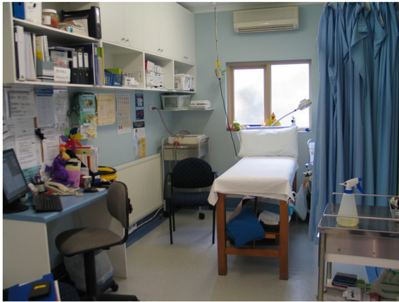
Figure 3 Treatment room.

clinical equipment and the organisation of the room indicate that this is a place where things are “done” to patients. There is very little personalisation of this workspace with esteem or social objects - objects conveying status or personality. The central object of this, and all treatment room photos, is the trolley or bed – reinforcing the centrality of the bed to nurse activity in this environment. The focus of this clinical workspace is on the patient – and the procedure to be undertaken - the nurse is secondary. This is in contrast to many medical consulting rooms that display personal artifacts important to the individual practitioner.