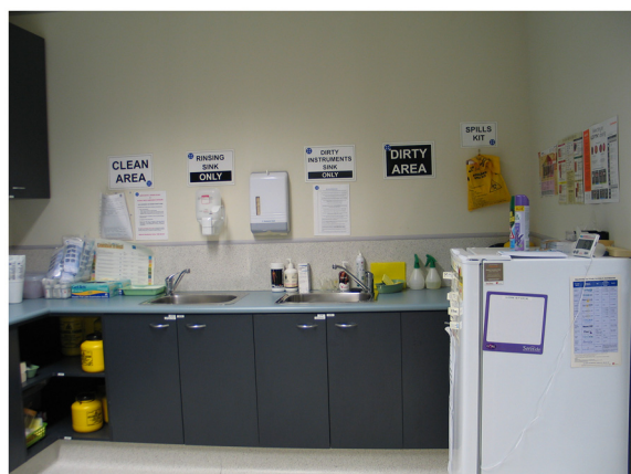
Figure 6 Treatment room.

“Room, space is... that would be the most difficult thing here, lack of space it just makes everything difficult. I don’t know if you noticed this morning I