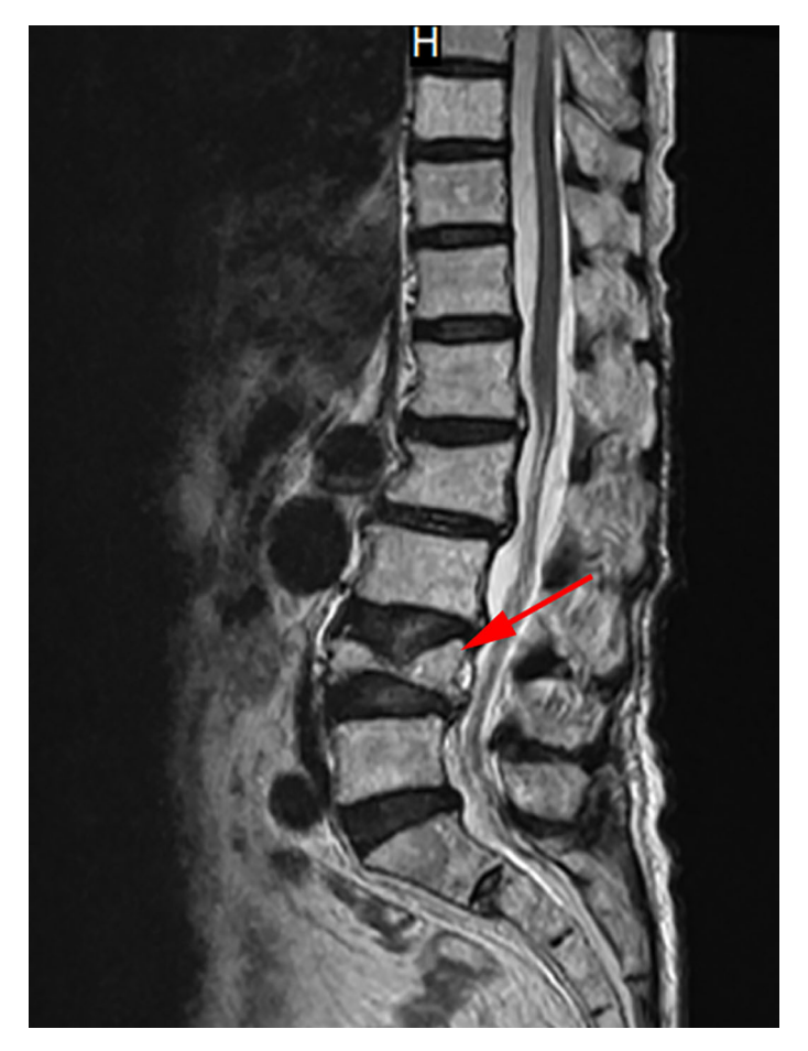
FIGURE 1 MRI of the lumbar vertebra. This image shows the MRI of the patient's lumbar vertebra. The red arrow marks the 4th lumbar vertebra with a compression fracture.