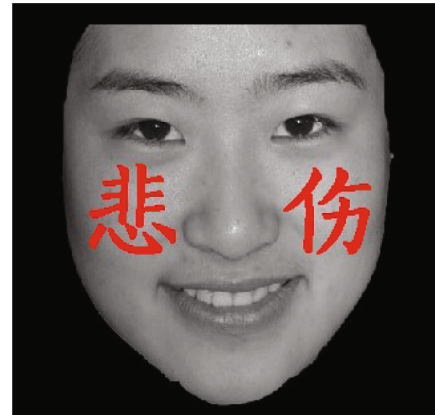
FIGURE 1: A sample stimulus in the emotional face-word Stroop task. The word on the face, which consists of two characters, means “sad”.

The face blocks and the word blocks differed in the response target in the Stroop task (face vs. word) and the source of the potential distraction (word vs. face). Thus, we used different ERP measures in the two types of blocks. Nevertheless, both types of blocks assessed emotional perception with potential conflict information.