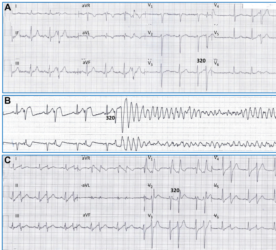
Figure 2 A: Electrocardiogram recorded 2 hours after the ablation procedure in the absence of symptoms. Note the ventricular extrasystoles with right bundle branch block (RBBB)-like morphology, leftward axis, yet fairly narrow QRS complexes (best appreciated at leads V 1 -V 2 ). The extrasystoles have a very short coupling interval (320 ms). These characteristics indicate that the ectopic beats originate from Purkinje fibers located in the area of ablation within the left posterior fascicle. B: One hour later, polymorphic ventricular tachycardia deteriorating to ventricular fibrillation is triggered by a ventricular extrasystole with short coupling interval. C: After defibrillation there is sinus rhythm with RBBB and ventricular bigeminy with coupling interval of 320 ms. Intravenous quinidine was started at this point.

sodium bicarbonate). This led to normalization of the ECG (Figure 3C). Quinidine was discontinued. Cardiac catheterization revealed a chronically occluded right coronary artery (known from a previous catheterization) with otherwise patent coronary arteries.