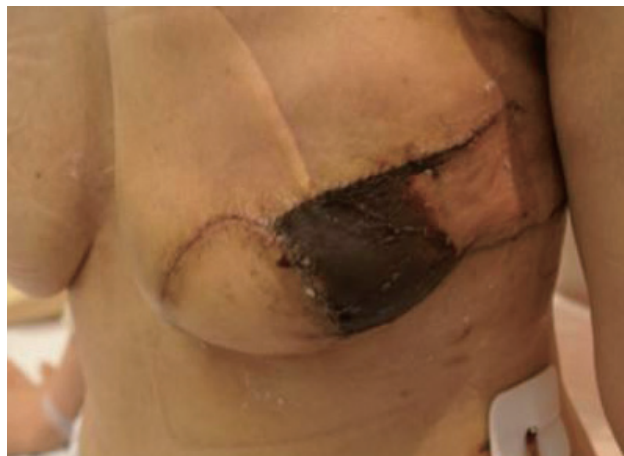
Figure 2. Postoperative wound complication after mastectomy with immediate breast reconstruction. Wound demarcation occurred after latissimus dorsi flap reconstruction. On 42 days after operation, escharectomy and bedside debridement underwent.