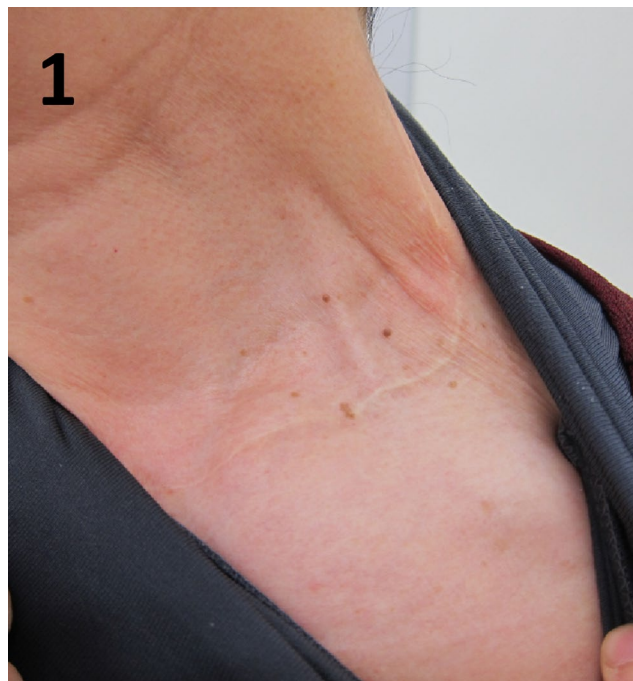
FIGURE 1 On physical examination, a surgical scar on the left side of her neck was observed

Although parathyroid tissue auto-transplantation is useful for preventing hypoparathyroidism during thyroidectomy, hyperparathyroidism may occur due to proliferation of the