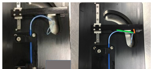
Fig. 4 Original equipment manufacturer (OEM) tests against a template. The “ D curve” of the circular mapping catheter is tested; the annotated green line measures the angle created by the shaft of the catheter. The orange line represents the angle of deflection from the catheter tip and has to be greater than 0 to pass the test

The remanufacturing of the catheters involved in the current study included a validated protocol to eliminate infective agents, involving thorough cleaning and exposure to the ethylene oxide. Ethylene oxide has been shown to be compatible with the polyurethane that forms most of the external surface of the catheter, and does not affect its appearance or physical characteristics. Other forms of sterilisation may induce a brittle or ‘yellowing’ quality to plastic polymers and can create additional friction between interacting catheter surfaces. Although no instance of transmission of infection by an electrophysiological catheter has been reported, it must be noted that it is notoriously difficult to fully assess prion transmission as prion-related conditions may remain indolent for decades.