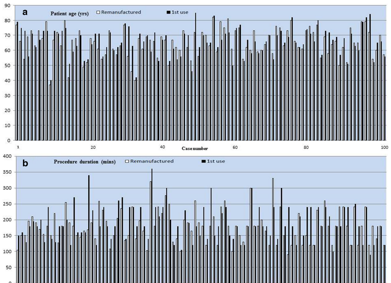
Fig. 2 Comparative graphs of remanufactured and first-use circular mapping catheters. a Patient age (years). b Procedure duration (min). Graph a is to demonstrate adequate propensity matching, which apart

Comparing the list prices, the remanufactured circular mapping catheter was 45% cheaper than the newly manufactured version. The cost savings to our department arising from these 100 cases amounted to £30,444.