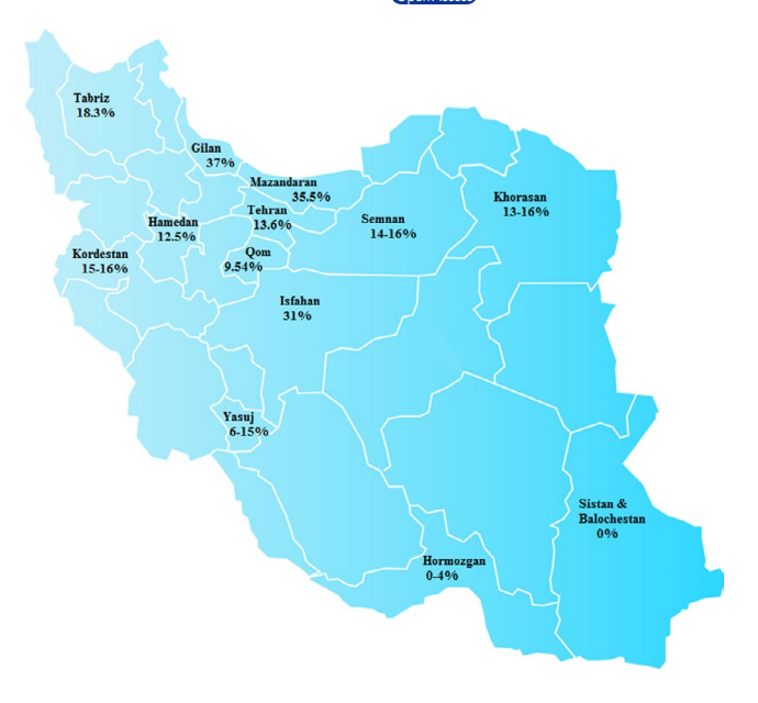
FIGURE 3 The frequency of the deletion c.35del G in the different regions of IRAN

Abbreviation: ARNSHL, autosomal recessive non-syndromic hearing loss.