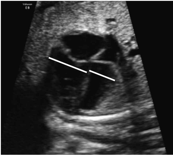
Fig. 2. — Four chamber view with ventricular disproportion (left side smaller than right side). The mid-cavary dimensions (white lines) can be measured and compared to normal sizes for gestational age.

neonatal intervention with the group that did not need intervention. Echocardiographic measurements were obtained at end diastole before atrioventricular valve closure and include long-axis dimensions and left and right mid-cavary width dimension. The primary aim of this study was to identify prenatal echocardiographic markers that predict critical coarctation and the need for neonatal arch intervention in the fetus with isolated left-right ventricular disproportion. A secondary aim was to describe the spectrum of postnatal diagnosis and outcomes of fetuses referred for evaluation of isolated left-right ventricular disproportion. They showed no significant difference in the long axis dimension ratio, but the left ventricle mid-cavary dimension to right mid cavary dimension (LVmc/RVmc) was statistically significant lower in the intervention group. LVmc/RVmc < 0.6 has shown a sensitivity of 70%, a specificity of 67% and a positive predictive value of 73% for neonatal intervention or critical coarctation.