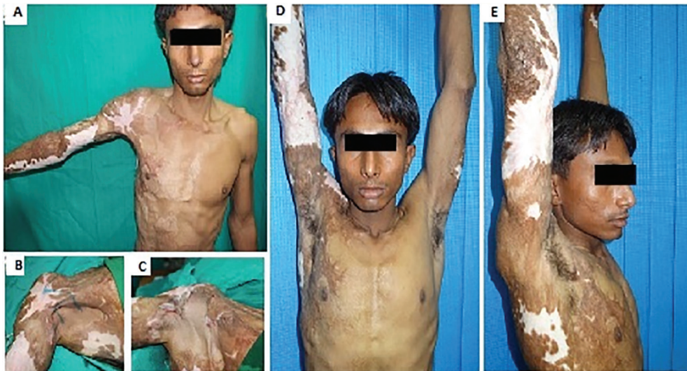
Fig. 2: A: Preoperative view of right axillary contracture type 1a; B: Preoperative marking of square flap; C: Sutured flaps after advancement of square flap and transposition of triangular flaps; D, E: Postoperative front and lateral view at 1.5 years follow up respectively showing full abduction of right shoulder.