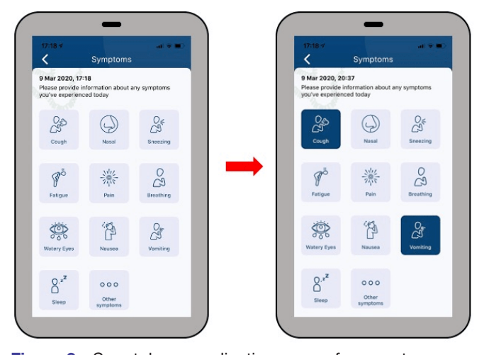
Figure 3 Smartphone application screen for symptom surveillance.

respiration rate at rest, skin blood perfusion, activity, steps, skin temperature, barometric pressure and electrodermal activity. The wearable biosensors will be worn for 22–23 hours per day and be recharged while bathing or showering. In addition, patients will be instructed to report their symptoms and record their cough sounds using the specially designed smartphone application daily. The physiological parameters obtained will be automatically transferred in real time through a specially designed smartphone application to a secured cloud storage for processing using the Biovitals Analytics Engine. The results will be displayed on a web-based clinician's dashboard for review (figures 2–5). The Biovitals Analytics Engine will process these multidimensional physiology parameters to detect subtle physiological changes preceding critical events, thereby enabling clinicians to promptly review and intervene. As an additional safety measure, specific alert thresholds for individual physiological parameters have also been set. Study investigators will remotely review the individual subject's physiological parameters every 4hours, and order diagnostic tests for COVID-19 infection through instant communication (electronic communication and/or phone). In addition, after the initial