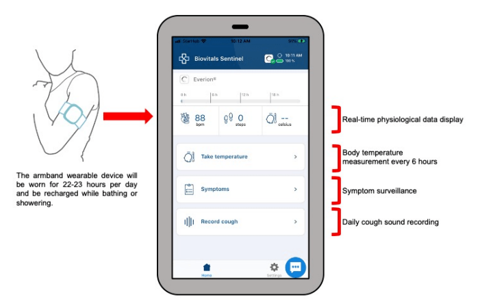
Figure 2 Wearable device and home screen of the dedicated smartphone application.

respiration rate at rest, skin blood perfusion, activity, steps, skin temperature, barometric pressure and electrodermal activity. The wearable biosensors will be worn for 22–23 hours per day and be recharged while bathing or showering. In addition, patients will be instructed to report their symptoms and record their cough sounds using the specially designed smartphone application daily. The physiological parameters obtained will be automatically transferred in real time through a specially designed smartphone application to a secured cloud storage for processing using the Biovitals Analytics Engine. The results will be displayed on a web-based clinician's dashboard for review (figures 2–5). The Biovitals Analytics Engine will process these multidimensional physiology parameters to detect subtle physiological changes preceding critical events, thereby enabling clinicians to promptly review and intervene. As an additional safety measure, specific alert thresholds for individual physiological parameters have also been set. Study investigators will remotely review the individual subject's physiological parameters every 4hours, and order diagnostic tests for COVID-19 infection through instant communication (electronic communication and/or phone). In addition, after the initial