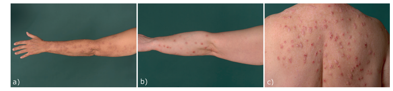
Fig. 3. Example of the evaluation of the proportion of excoriated nodules vs non-excoriated nodules: (a) few, (b) moderate, (c) many.

All data analyses were performed with SPSS 25 (Statistical Package for the Social Science) and p -values < 0.05 were considered significant.