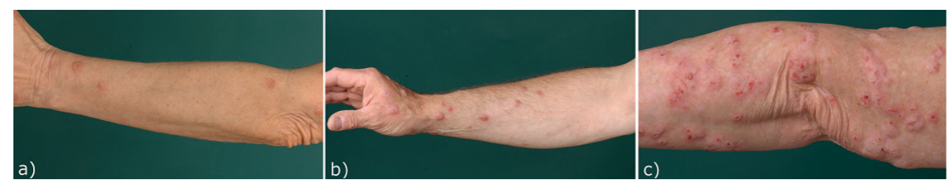
Fig. 1. Example of the evaluation of the estimated number of nodules: (a) few, (b) moderate, (c) many.

Hospital Münster, Germany (7). This study was approved by the ethics committee of the Medical Faculty of the University of Münster (2007-413-f-S).