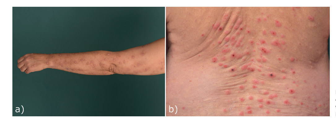
Fig. 2. Example of the evaluation of the inflammation of nodules: (a) noninflamed, (b) inflamed.

For normally distributed samples t -test was used to compare differences between 2 subgroups. For data that did not meet the criteria of normal distribution non-parametric tests were used (Mann–Whitney U test for analysis between 2 groups, Kruskal–Wallis test for more than 2 groups,). Dunn-Bonferroni post-hoc test was used for pairwise multiple comparisons. Categorical parameters were analysed with \chi^2 and Fisher's exact tests. Logistic and ordinal regression analyses were used to identify predictors of therapeutic success.