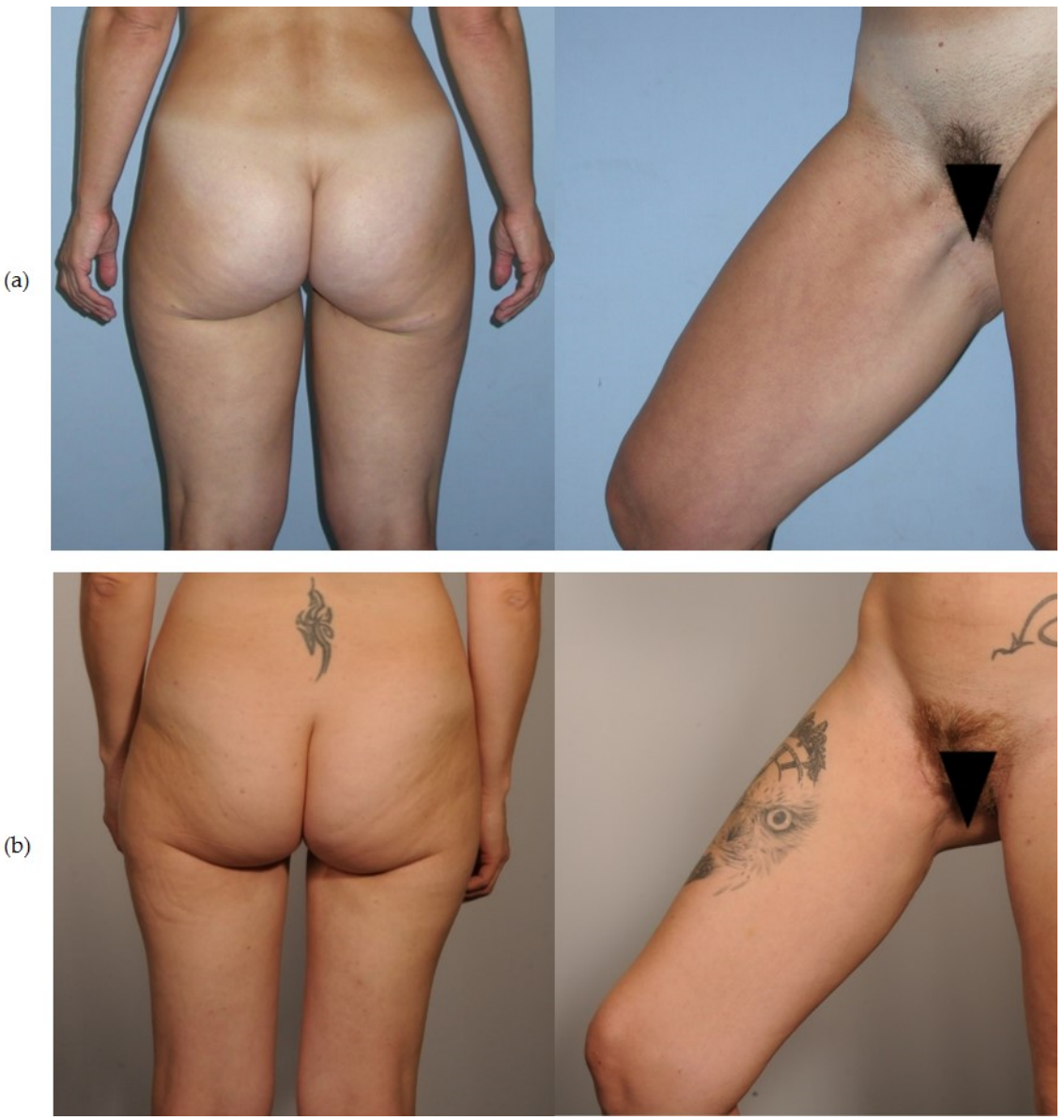
Figure 3. Cosmetic results. Post-operative views of donor-site after bilateral flap harvesting: (a) TMG flap and (b) PAP flap.

Measurement of the circumference of the thigh revealed in PAP patients with unilateral flap harvesting a difference of 3.28 ( \pm 1.31) cm, while PAP patients with bilateral donor-sites presented a difference of 0.75 ( \pm 0.66) cm between the two legs (Figure 3; below). Table 4 shows the difference in thigh circumference in patients with unilateral flap harvesting for both groups. Mean difference between both thighs was 0.96 cm greater in PAP patients compared to the TMG group.