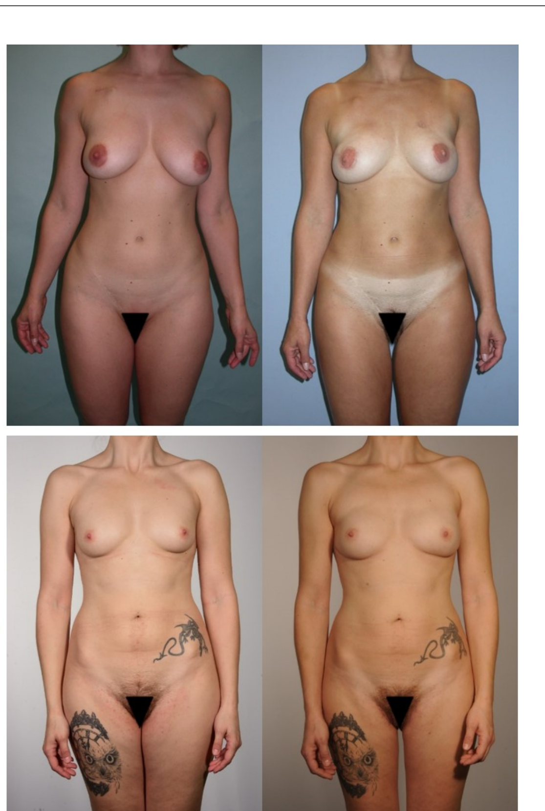
Figure 1. (Left) Preoperative and (right) post-operative views of bilateral breast reconstruction with donor-site in the thigh region: ( a ) TMG flap and ( b ) PAP flap.