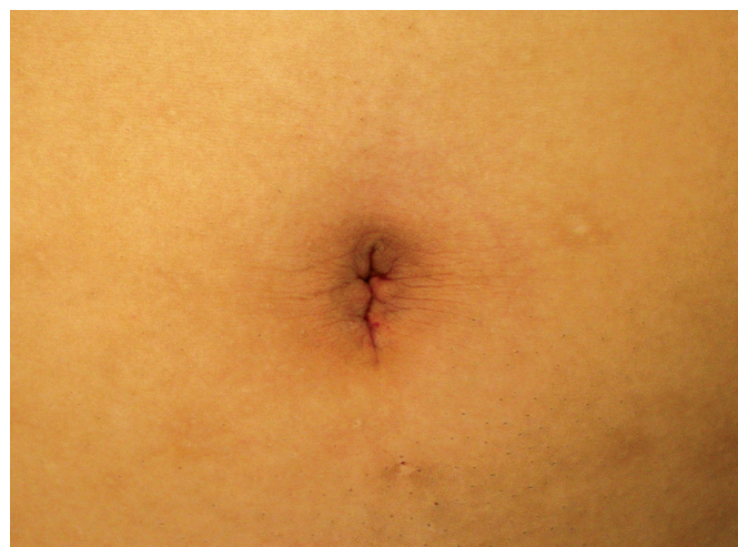
Fig. 1. Surgical wound after laparoscopic appendectomy with a single incision.

BMI, body mass index; Pre.op, pre-operative; WBC, white blood cell; seg., segment; POD, post-operative day.