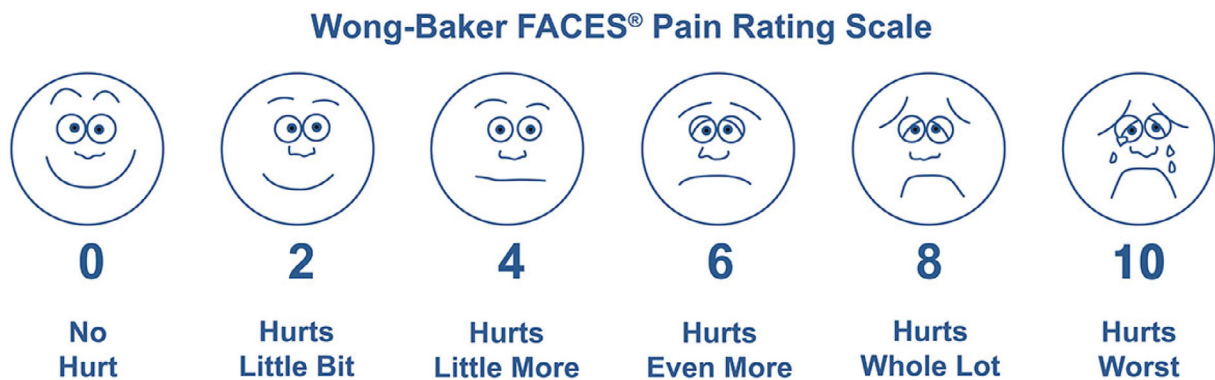
FIGURE 2 Wong-Baker FACES® pain rating scale (Home - Wong-Baker FACES Foundation, n.d.). The Faces Pain Scale–Revised (FPS-R) scored 0, 2, 4, 6, 8 and 10. It shows a close linear relationship with visual analogue pain scales across the age range of 4–6 years. It is easy to administer and requires no equipment except for the photocopied faces. Score the chosen face 0, 2, 4, 6, 8, or 10, counting left to right, so “0” = “no pain” and “10” = “very much pain.” Do not use words like “happy” and “sad.” This scale is intended to measure how children feel, not how their face looks. Wong-Baker FACES Foundation (2018). Wong-Baker FACES® Pain Rating Scale. Retrieved Oct 19, 2018 with permission from http://www.WongBakerFACES.org

Wong-Baker Faces Pain Rating Scale is self-assessment tool (0: No Hurt, 2; Hurts Little Bit, 4; Hurts Little More, 6; Hurts Even More, 8; Hurts Whole Lot, 10; Hurts Worst); therefore, the individual should be communicable to address own pain. (2) Dentist's perceptive determination of child's behavior was collected using the Frankl behavior rating scale following the American Academy of Pediatric Dentistry Behavior Guidance for the pediatric dental patient. (AAPD, 2020). The Frankl behavior rating scale is a frequently used behavior rating systems in both clinical dentistry and research. This scale indicates observed child's behaviors into four categories (1; Definitely negative, 2; Negative, 3; Positive, 4; Definitely positive).