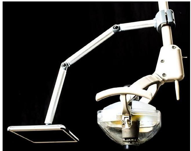
FIGURE 3 Molar media mount (Molar Media Mount, LLC, n.d.). The Molar Media Mount is made of lightweight, high-strength materials, and is specifically constructed to work with device of 16 oz. or less in weight. The Molar Media Mount was used to mount the AVD and attached to the light compartment of dental chair unit with adjustable arm extension.

Prior to the dental procedure, each child from the both CTR and AVD groups was shown the Wong-Baker Face Pain Rating Scale panel and pointed out their expression ranged as 0 (No Hurt) to 10 (Hurts Worst) as an initial evaluation. After the informed agreement of dental procedure, parents were asked to stay in the reception area during the dental procedure for both control and treatment groups. The CTR group received dental treatment under the basic behavioral guidance of TSD and Nitrous oxide (N 2 O) inhalation. The N 2 O inhalation procedure was provided as minimal sedation and followed by the guideline (Use of nitrous oxide for pediatric dental patients, 2017). The treatment group received dental treatment using the AVD. Children in both groups underwent an operative appointment either a placement of stainless- steel crown (SSC) restoration or an extraction under the administration of local anesthesia. The AVD was provided in the form of Disney copyrighted movies in English or Spanish version based on the children's preference. The AVD was attached to the dental light compartment using the extensive arm (Molar Media Mount LLC, Millcreek, Washington United States) as shown as Figure 3 (Molar Media Mount, LLC, n.d.). The mounted AVD is a 9.7-in. wide screen