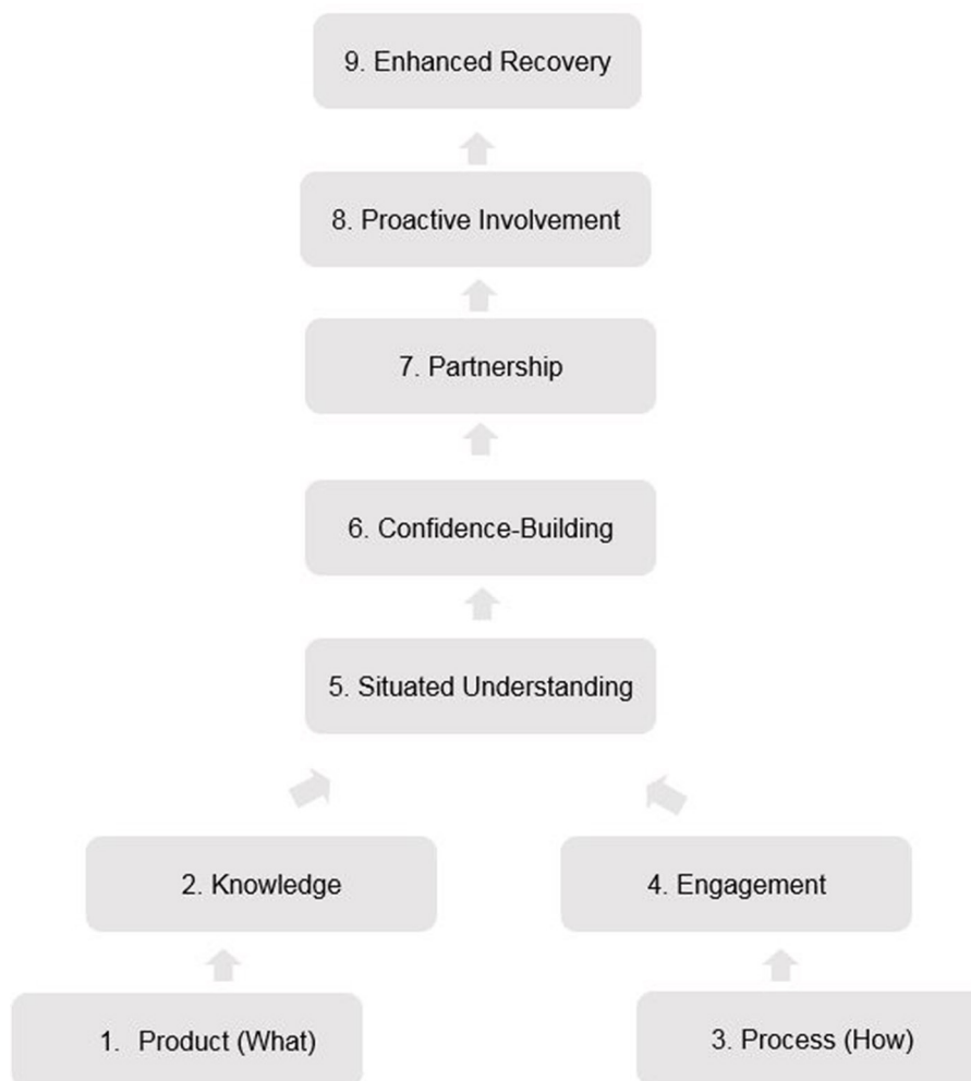
Figure 3 Showing links between preoperative education and enhanced recovery.

of information-giving and how to identify as relevant changes that could encourage proactive involvement of patients as partners in their own recovery, hence contributing to enhanced recovery as identified in previous research. 12 13 20 Specifically our study identified the importance of patients being able to interactively develop their individual understandings of events within the hospital settings, interventions during and after colorectal surgery and the impact on them ('situated understanding'). Our findings also highlighted the importance of attending to their emotional needs, which Fecher-Jones and Taylor found was often unrecognised, in their 'emotional struggle to regain control of health and well-being' (p. 225). 16