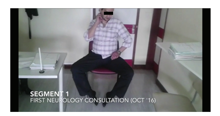
Video 1 (case 1). Neurological examination of patient 1. Segment 1: Patient at age 42 showing slight dysarthria, generalized chorea (worse on the left) with oromandibular involvement, bilateral hand dystonia and ataxic gait. Segment 2: worsening of involuntary movements, with bilateral ballistic movements of limbs. Segment 3: after rifaximin treatment, chorea and ballism disappeared. A mild hand dystonia and a slightly ataxic gait is evident. Segment 4: clinical worsening with mental slowness, hypomimia, positive upper limb myoclonus with axial and appendicular hypotonia, without chorea. This segment is part of a fluctuating disease course, despite treatment.