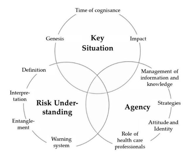
Figure 1. Central categories of dealing with disease risk: key situation, risk understanding, and agency.