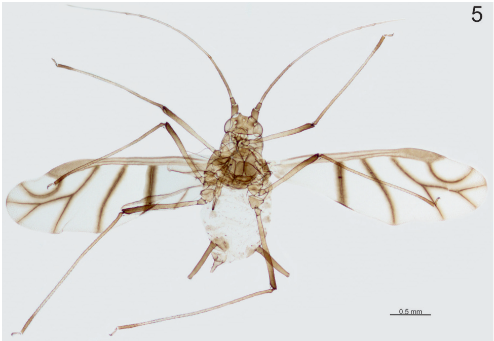
Figure 5. Microscopic slide of the paratype specimen – alate viviparous female of Micromyzus platycerii .

Legs covered by short, pointed hairs, shorter than the middle diameter of tibia. Distal half of femora dark; tibiae pale except for dark apices, tarsi black. Ventral side of each first tarsal segment with one thick, pointed, peg-like seta and two thinner setae (Fig. 3). Second segment of tarsus 0.096–0.103 mm long.