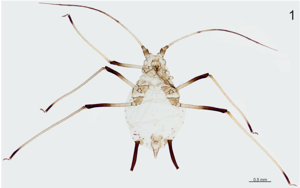
Figure 1. Microscopic slide of the holotype specimen – apterous viviparous female of Micromyzus platycerii .