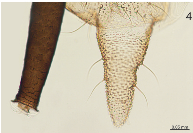
Figures 2–4. Morphological features of apterous viviparous female of M. platycerii : 2 head and rostrum 3 tarsus of hind leg 4 cauda and apex of siphunculus.