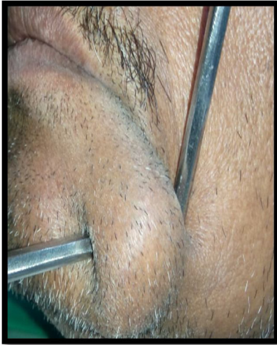
Fig. 1. Extra Oral Photograph Showing Swelling Near Commissure of the Mouth on the Left Side Measuring 5 cm × 3 cm.

size and wasn't associated with pain, paresthesia, or difficulty in mastication. No such mass was observed on any other part of the body. There was no history of any tooth extraction or trauma to that region. Patient had a history of tobacco chewing since 10–15 years, 3–4 times a day. There was no relevant genetic information. No relevant medical history, surgical history, family history, drug history or psychosocial history.