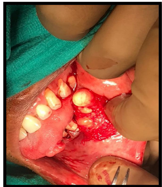
Fig. 3. Intraoperative photo of Excision of Lipoma.

complete lesion was excised. Tongue mass was excised, hemostasis was achieved and closure of mucosa was done using 3-0 Vicryl synthetic absorbable sutures on both the sites. Excised tissue was then stored in 10% formalin and was sent for histopathological examination (Fig. 3). Post-operative pressure dressing was given in the chin region for 3 days. Post-op antibiotic and analgesic were administered i.e. Inj Augmentin 1.2 gm Intravenous BD, Inj Dynapar (in 100cc ns) Intravenous TDS. After a follow-up of 1 year patient showed no signs of recurrence. Clinically the swelling on left chin region subsided after post op day 3. No signs of mental nerve paresthesia.