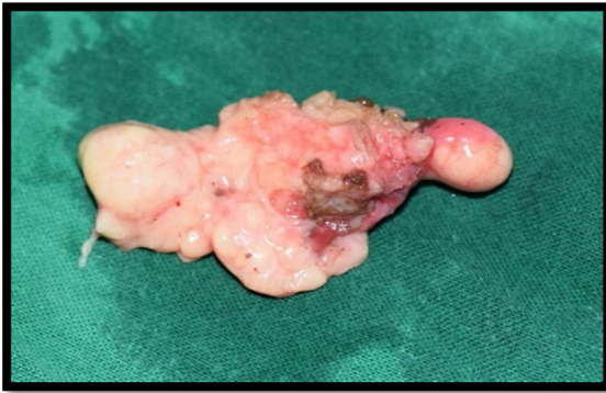
Fig. 4. Excised specimen of lipoma.