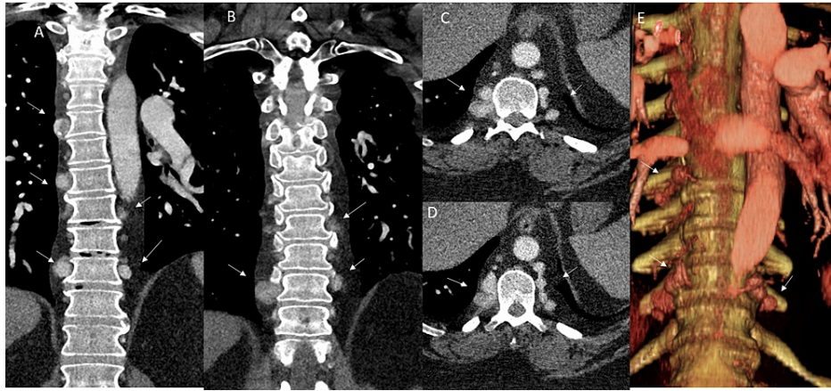
FIGURE 1: Intercostal artery aneurysmosis on CT angiogram

Multiple coronal (A, B) and axial (C, D) CT angiogram images reveal multiple variable-sized intercostal artery aneurysms in the bilateral paravertebral region from the fifth to the tenth (T5-T10) vertebral levels, measuring 0.4-1.7 cm in diameter (arrows). The intercostal origin of these aneurysms was confirmed on the source angiogram and colored volume-rendered image (E).