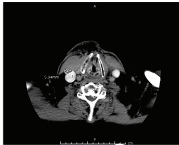
Initial soft tissue CT of the head/neck demonstrating right cervical lymph node enlargement.

(a) Demonstrating the first patient's (55-year-old male) response with initial imaging and final image