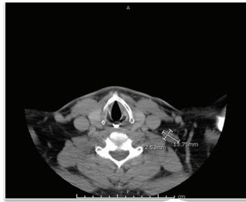
Initial soft tissue CT of the head/neck demonstrating left cervical mass.