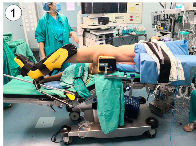
Figure 1 Patient position. The patient was placed in standard 90° full flank position and secured to the table, then the table was rotated to maximize exposure of the kidney.

After general anesthesia, patients were placed in standard 90° full flank position and secured to the table, then the table was rotated to maximize exposure of the kidney (Figure 1). The layout of the trocar is shown in Figure 2. A 2-cm incision was made at the center between the 12th rib and the erector spinae muscle (port B), the retroperitoneal space was entered by blunt finger dissection. After a retroperitoneal working space had been created using a balloon dissector, a 10-mm trocar was inserted at the middle axillary line 3 cm cephalad to the iliac crest (port A), and another 5-mm trocar was placed at the tip of the 11th rib (port C). After the pneumoperitoneum was created, laparoscopic camera and instruments were placed into port A, B and C, respectively. By dissecting along the psoas muscle, the posterior surface of the kidney was reflected medially. Then renal pedicle was identified with dissection of the renal artery and vein (Figure 3). After the renal vessels were isolated and clipped successively by Hem-o-lok clips, kidney was mobilized outside the perirenal fascia. The adrenal gland was spared in all cases unless involvement was suspected. The ureter was then mobilized caudally toward the level of iliac vessels. A surgical drain