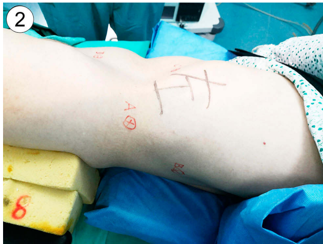
Figure 2 Trocar placement in retroperitoneal operation. A 2-cm incision was made at the center between the 12th rib and the erector spinae muscle (port B), a 10-mm trocar was inserted at the middle axillary line 3 cm cephalad to the iliac crest (port A), and another 5-mm trocar was placed at the tip of the 11th rib (port C).