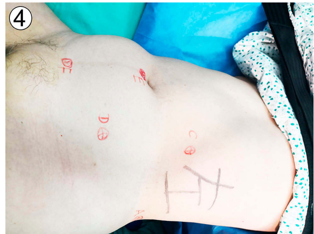
Figure 4 Trocar placement in transperitoneal operation. A 10-mm trocar at the lower level of the umbilicus (port E), a 5-mm trocar at the midpoint of the line between the umbilicus and the anterior superior iliac spine (port D), and the last 12-mm trocar was placed 2 cm cranial to the pubic symphysis in the middle line (port F).