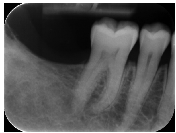
Fig. 3: Two years follow-up.

The patient presented for radiography control 6 months after surgery. The patient was called back to our department 2 years after surgical treatment for a new radiographic follow-up that shows a complete healing (Fig. 3).