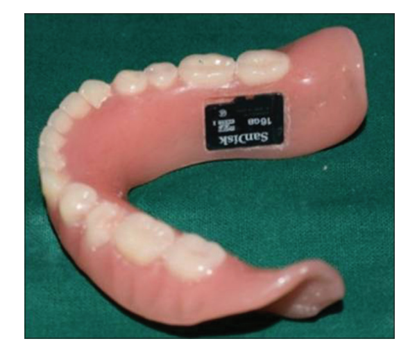
Figure 2: Micro SD card