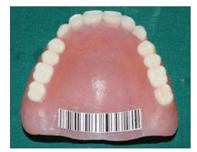
Figure 1: Bar code

Various aids for patients with fixed dental prosthesis include: