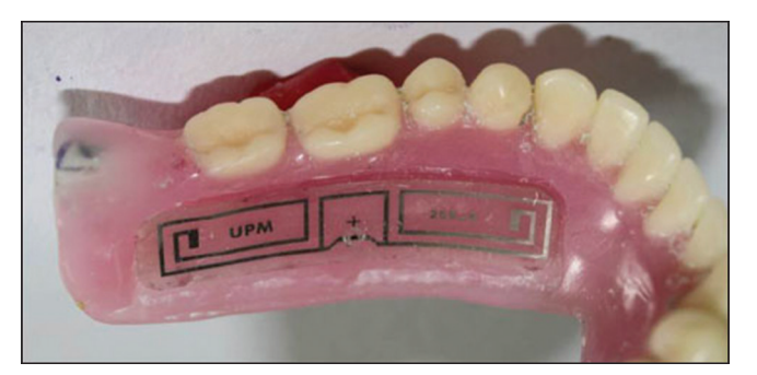
Figure 4: Radiofrequency identification tags

Tooth structure provides greater protection to chips by the virtue of greater resistance to high temperature, acid attacks, humid, and saline environment.