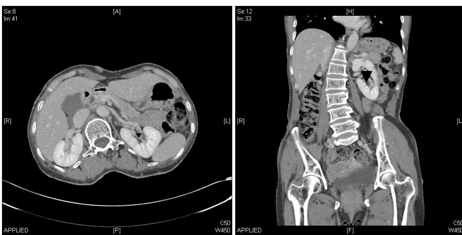
FIG. 3. Multi-detector computed tomography (MDCT) angiography image of a 60-year-old man. Although 1 renal artery and 1 renal vein (▼) were observed in the left kidney, an additional vein was found on the upper pole of the kidney during the actual operation.

(83%), that for the adrenal vein was 27/33 (83%), and that for the lumbar vein was 13/20 (75%) [17]. Bhatti et al reported that the accuracy for the gonadal veins was 74% and