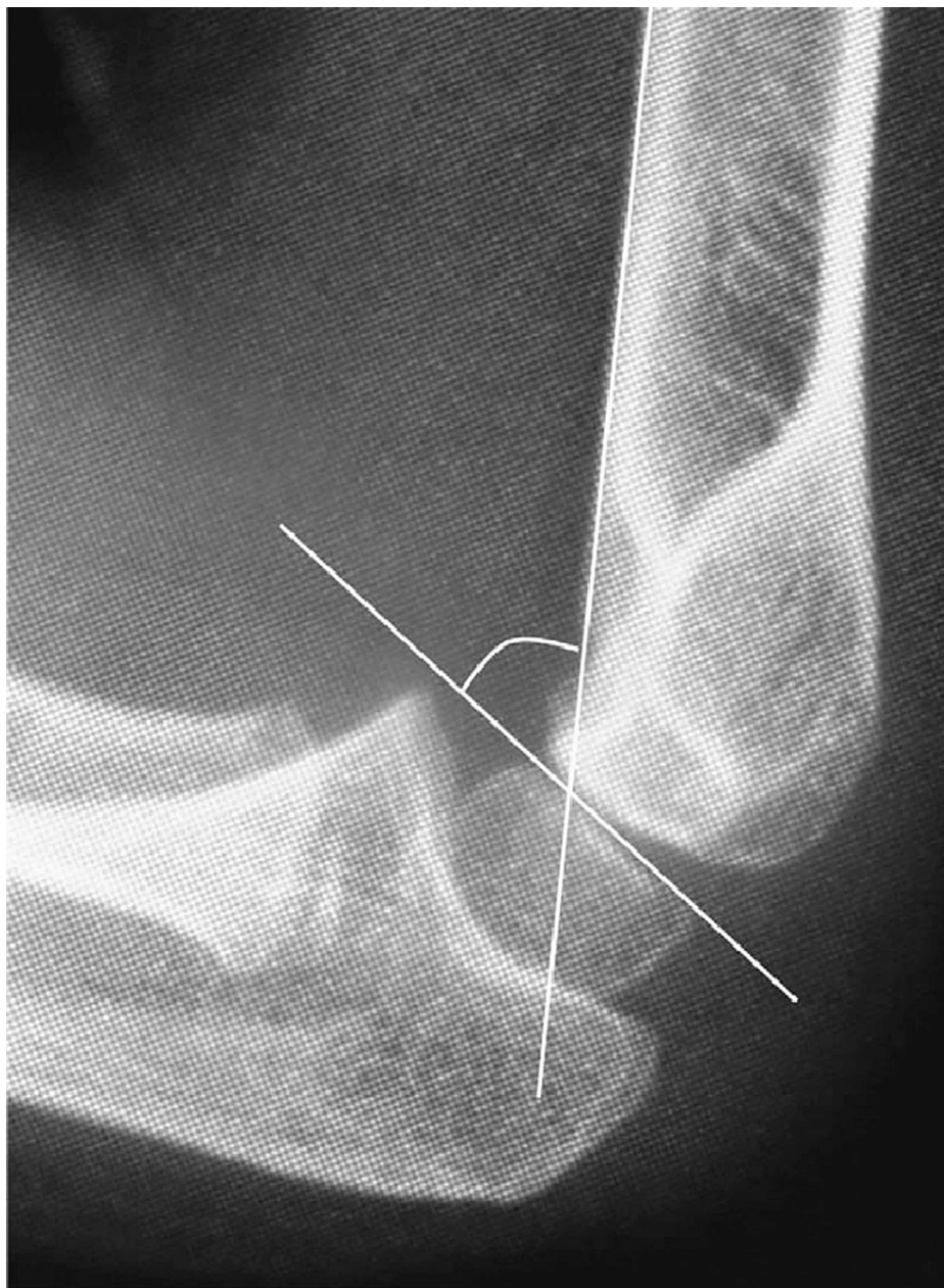
FIGURE 2: Illustration of lateral capitellohumeral angle (LCHA)

The image is taken from Hasegawa et al. (2021) [14]; permission of use obtained.