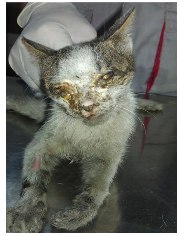
Fig. 1. One of clinical cases with severe URTD in the present study. Nasal and ocular discharge with corneal ulcer was clearly observed in this case.

Primers. Two pairs of oligonucleotide primers were used for the amplifying reaction. We used the previously