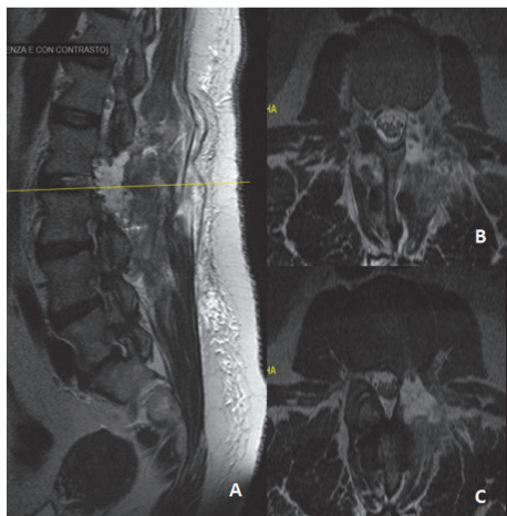
FIGURE 3: A postoperative MRI scan demonstrating complete resection of the sequestered disc material. Note the decompression of the dural sac and nerve root. L2-L3 arthroctomy and interspinous fixation at the same level were performed.